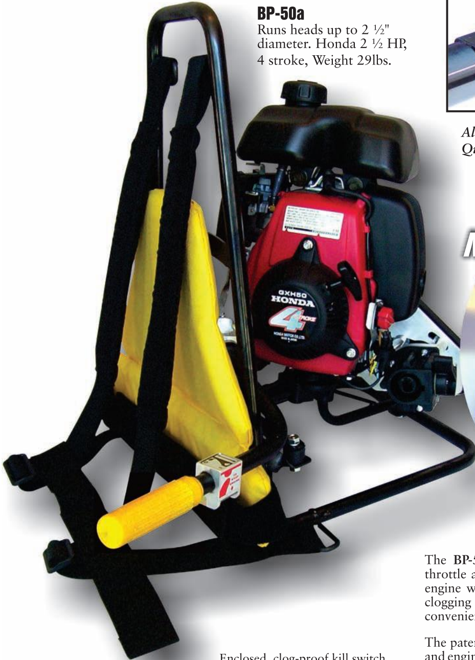
Enclosed, clog-proof kill switch

Runs heads up to 2 1/2" diameter. Honda 2 1/2 HP, 4 stroke, Weight 29lbs.